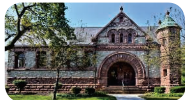
Richmond Memorial Library, Batavia