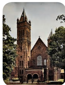
First Lutheran Church of Jamestown