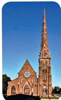
First Presbyterian Church, Albion