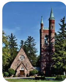
Holy Sepulchre Cemetery, Rochester