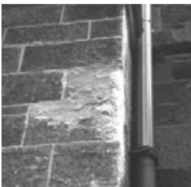
Inappropriate repair methods, such as painting (top) and cementitious coatings (bottom), tend to trap moisture and mask underlying brownstone deterioration.

Repainting of sound stone that has already been painted is an option if paint removal is likely to cause damage or if it would expose old, non-matching repairs. If painting is appropriate, use oil-based paint over previously painted stone and latex paint on exposed stone.