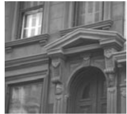
Years of weathering caused the brownstone details to deteriorate (left), but careful composite repairs (center) restore it to its original glory (right)

admixtures, and water. Most masons have their own preferred composite patching system, and in general, it makes sense to use the system with which your mason is most familiar.