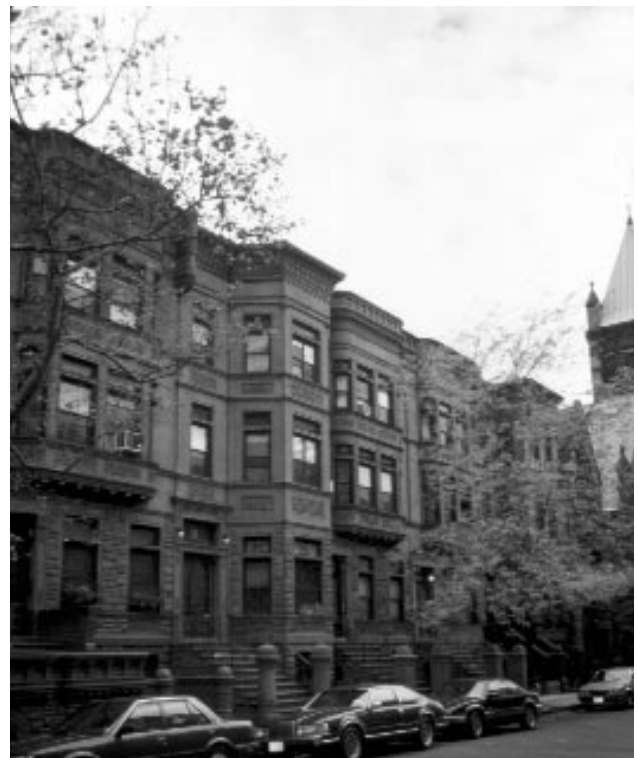
Brownstone homes, like these Harlem row houses, were built by the thousand throughout the Northeast in the late-nineteenth century.

Almost as soon as sandstone became prominent as a building material, it became known for its tendency to decay. Unfortunately, its layered composition and high porosity means that brownstone deteriorates easily. It is especially susceptible to the action of water, salts, freeze-thaw cycling, air pollutants, and similar factors. In the Northeast, the local climate consisting of wet winters with daily temperature fluctuations has proven to be particularly hard on the material. Consequently, brownstone presents significant maintenance and repair problems for many owners of historic brownstone buildings.