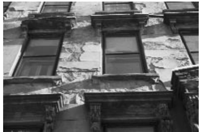
Severely exfoliating brownstone can be both unattractive and detrimental to the building.

Exfoliation: Separation and failure of stone along its sedimentary bedding planes. Exfoliation causes the most dramatic failure when a stone unit is "face-bedded," with its bedding planes set parallel to the finished face of the stone. "Blind exfoliation" describes bedding layers that have separated but are still loosely attached, causing the finished surface to sound hollow. Exfoliation is caused by the failure of weakly cemented layers in a stone unit.