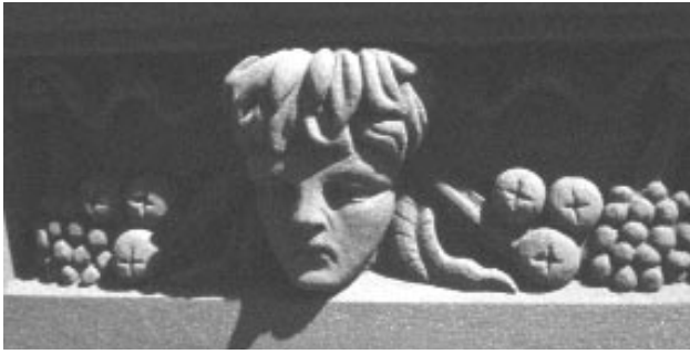
The relative softness of brownstone lends itself to decorative carvings and building ornamentation.