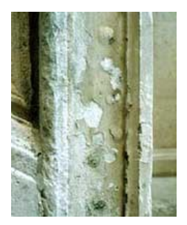
This clear coating has failed and is pulling off pieces of the stone as it peels.

Some modern water-repellent coatings which contain a binder intended to replace the natural binders in stone that have been lost through weathering and natural erosion are described in product literature as both a water repellent and a consolidant The fact that the newer waterrepellent coatings penetrate beneath the masonry surface instead of just forming a layer on top of the surface may indeed convey at least some consolidating properties to certain stones. However, a water-repellent coating cannot be considered a consolidant. In some instances, a water-repellent or "preservative" coating, if applied to already damaged or spalling stone, may form a surface crust which, if it fails, may exacerbate the deterioration by pulling off even more of the stone.