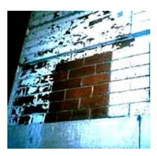
Any cleaning method should be tested before using it on historic masonry.

The importance of testing cleaning methods and materials cannot be over emphasized. Applying the wrong cleaning agents to historic masonry can have disastrous results. Acidic cleaners can be extremely damaging to acid-sensitive stones, such as marble and limestone, resulting in etching and dissolution of these stones. Other kinds of masonry can also be damaged by incompatible cleaning agents, or even by cleaning agents that are usually compatible. There are also numerous kinds of sandstone, each with a considerably different geological composition. While an acid-based cleaner may be safely used on some sandstones, others are acid-sensitive and can be severely etched or dissolved by an acid cleaner. Some sandstones contain water-soluble minerals and can be eroded by water cleaning. And, even if the stone type is correctly identified, stones, as well as some bricks, may contain unexpected impurities, such as iron particles, that may react negatively with a particular cleaning agent and result in staining. Thorough understanding of the physical and