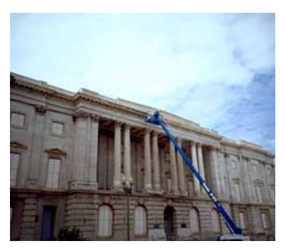
Low-to-medium-pressure steam (hotpressurized water washing) is a gentle method of softening heavy soiling deposits and cleaning historic marble.

Non-ionic detergents—which are not the same as soaps—are synthetic organic compounds that are especially effective in removing oily soil. (Examples of some of the numerous proprietary non-ionic detergents include Igepal by GAF, Tergitol by Union Carbide and Triton by Rohm & Haas.) Thus, the addition of a non-ionic