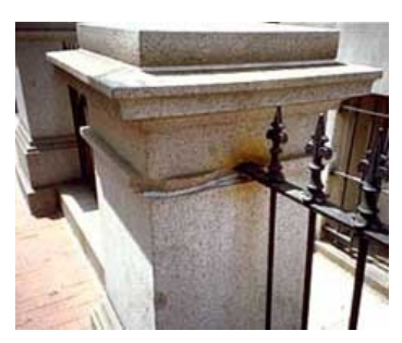
The iron stain on this granite post may be removed by applying a commercial rustremoval product in a poultice.

Generally, abrasive cleaning methods are not appropriate for use on historic masonry buildings. Abrasive cleaning methods are just that—abrasive. Grit blasters, grinders, and sanding discs all operate by abrading the dirt or paint off the surface of the masonry, rather than reacting with the dirt and the masonry which is how water and chemical methods work. Since the abrasives do not differentiate between the dirt