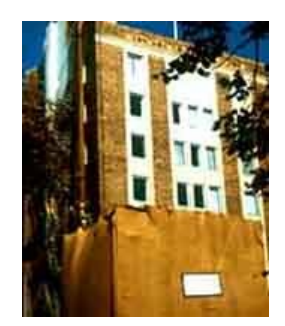
The lower floors of this historic brick and architectural terracotta building have been covered during chemical cleaning to protect pedestrians and vehicular traffic from

Possible health dangers of each method selected for the cleaning project must be considered before selecting a cleaning method to avoid harm to the cleaning applicators, and the necessary precautions must be taken. The precautions listed in Material Safety Data Sheets (MSDS) that are provided with chemical products should always be followed. Protective clothing, respirators, hearing and face shields, and gloves must be provided to workers to be worn at all times. Acidic and alkaline chemical cleaners in both liquid and vapor forms can also cause serious injury to