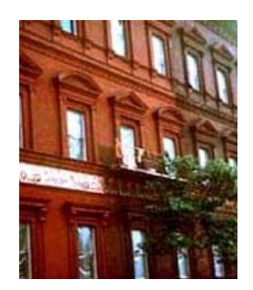
Appropriate cleaning of historic masonry.

Preparing for a Cleaning Project Understanding the Building Materials Cleaning Methods and Materials Planning a Cleaning Project Water-Repellent Coatings and Waterproof Coatings Summary and References Reading List Download the PDF