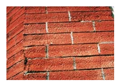
Sandblasting has permanently damaged this brick wall.

portion of the masonry surface (up to 20 per cent in a brick wall), this can result in the loss of a considerable amount of the historic fabric. Erosion of the mortar joints may also permit increased water penetration, which will likely necessitate repointing.