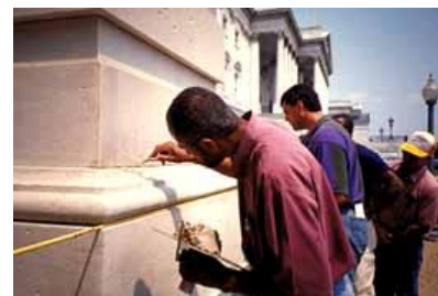
Masons practice using lime putty mortar to repair historic marble.

Examination and analysis of the masonry units—brick, stone or terra cotta—and the techniques used in the original