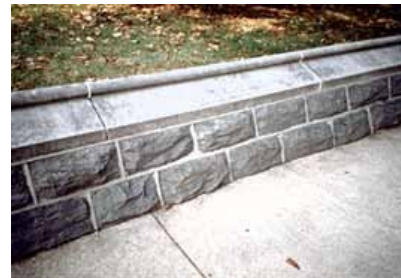
Caulking was inappropriately used here in place of mortar on the top of the wall. As a result, it has not been durable.

Lime, itself, when mixed with water into a paste is very plastic and creamy. It will remain workable and soft indefinitely, if stored in a sealed container. Lime (calcium hydroxide) hardens by carbonation absorbing carbon dioxide primarily from the air, converting itself to calcium carbonate. Once a lime and sand mortar is mixed and placed in a wall, it begins the process of carbonation. If lime mortar is left to dry too rapidly, carbonation of the mortar will be reduced, resulting in poor adhesion and poor durability. In addition, lime mortar is slightly water soluble and thus is able to re-seal any hairline cracks that may develop during the life of the mortar. Lime mortar is soft, porous, and changes little in volume during temperature fluctuations thus making it a good choice for historic buildings. Because of these qualities, high calcium lime mortar may be considered for many repointing projects, not just those involving historic buildings.