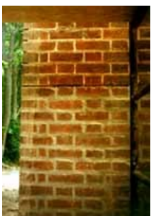
A mechanical grinder improperly used to cut out the horizontal joint and

Building managers also must recognize the difficulties that a repointing project can create. The process is time consuming, and scaffolding may need to remain in place for an extended period of time. The joint preparation process can be quite noisy and can generate large quantities of dust which must be controlled, especially at air intakes to protect human health, and also where it might damage operating machinery. Entrances may be blocked from time to time making access difficult for both building tenants and visitors. Clearly, building managers will need to coordinate the repointing work with other events at the site.