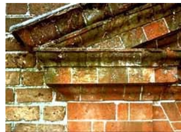
This 18th century pediment and surrounding wall exhibit distinctively different mortar joints.

New construction "bloom" or efflorescence occasionally appears within the first few months of repointing and usually disappears through the normal process of weathering. If the efflorescence is not removed by natural processes, the safest way to remove it is by dry brushing with stiff natural or nylon bristle brushes followed by wet brushing. Hydrochloric