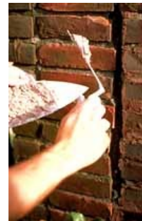
This mortar is the proper consistency for repointing historic brick.