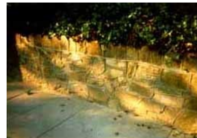
When repairing this stone wall, the mason matched the raised profile of the original tuckpointing.

The relationship of repointing to other work proposed on the building must also be recognized. For example, if paint removal or cleaning is anticipated, and if the mortar joints are basically sound and need only selective repointing, it is generally better to postpone repointing until after completion of these activities. However, if the mortar has eroded badly, allowing moisture to penetrate deeply into the wall, repointing should be accomplished before cleaning. Related work, such as structural or roof repairs, should be scheduled so that they do not interfere with repointing and so that all work can take maximum advantage of erected scaffolding.