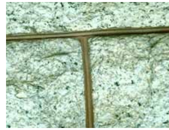
This late 19th century granite has recently been repointed with the joint profile and mortar color carefully matched to the original.

Instrumental analysis methods that have been used to evaluate mortars include polarized light or thin-section microscopy, scanning electron microscopy, atomic absorption spectroscopy, X-ray diffraction, and differential thermal analysis. All instrumental methods require not only expensive, specialized equipment, but also highly-trained experienced analysts. However, instrumental methods can provide much more information about a mortar. Thin-section microscopy is probably the most commonly used instrumental method. Examination of thin slices of a mortar in transmitted light is often used to supplement acid digestion methods, particularly to look for carbonate-based aggregate. For example, the new ASTM test method, ASTM C 1324-96 "Test Method for Examination and Analysis of Hardened Mortars" which was designed specifically for the analysis of modern lime-cement and masonry cement mortars, combines a complex series of wet chemical analyses with thin-section microscopy.