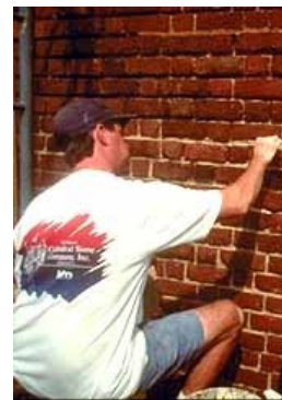
This early 19th century building is being repointed with lime mortar.

Permeability, or rate of vapor transmission, is also critical. High lime mortars are more permeable than denser cement mortars. Historically, mortar acted as a bedding material—not unlike an expansion joint—rather than a "glue" for the masonry units, and moisture was able to migrate through the mortar joints rather than the masonry units. When moisture evaporates from the masonry it deposits any soluble salts either on the surface as efflorescence or below the surface as subflorescence . While salts deposited on the surface of masonry units are usually relatively harmless, salt crystallization within a masonry unit creates pressure that can cause parts of the outer surface to spall off or delaminate. If the mortar does not permit moisture or moisture vapor to migrate out of the wall and evaporate, the result will be damage to the masonry units.