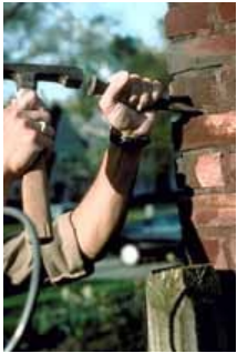
Here, a hammer and chisel are being correctly used to prepare a joint for repointing.

Type S (1,800 psi), Type N (750 psi), Type O (350 psi) and Type K (75 psi). (The letters identifying the types are from the words MASON WORK using every other letter.) Type K has the highest lime content of the mixes that contain portland cement, although it is seldom used today, except for some historic preservation projects. The designation "L" in the accompanying chart identifies a straight lime and sand mix. Specifying the appropriate ASTM mortar by proportion of ingredients, will ensure the desired physical properties. Unless specified otherwise, measurements or proportions for mortar mixes are always given in the following order: cement-lime-sand. Thus, a Type K mix, for example, would be referred to as 1-3-10, or 1 part cement to 3 parts lime to 10 parts sand. Other requirements to create the desired visual qualities should be included in the specifications.