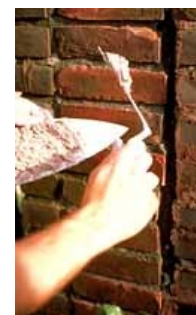
Soft mortar for repointing.

Masonry—brick, stone, terra-cotta, and concrete block—is found on nearly every historic building. Structures with all-masonry exteriors come to mind immediately, but most other buildings at least have masonry foundations or chimneys. Although generally considered "permanent," masonry is subject to deterioration, especially at the mortar joints. Repointing, also known simply as "pointing" or—somewhat inaccurately—"tuck pointing"*, is the process of removing deteriorated mortar from the joints of a masonry wall and replacing it with new mortar. Properly done, repointing restores the visual and physical integrity of the masonry. Improperly done, repointing not only detracts from the appearance of the building, but may also cause physical damage to the masonry units themselves.