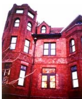
Unskilled repointing has negatively impacted the character of this late-19th century building.

These panels are prepared by the contractor using the same techniques that will be used on the remainder of the project. Several panel locations—preferably not on the front or other highly visible location of the building—may be necessary to include all types of masonry, joint styles, mortar colors, and other problems likely to be encountered on the job.