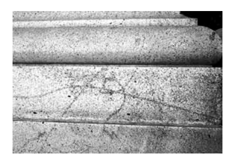
Very high-pressure water has scarred this granite.

Occasionally, it may be possible to clean small areas of rough-cut granite, limestone or sandstone having a heavy dirt encrustation by using the "wet grit" method, whereby a small amount of abrasive material is injected into a controlled, pressurized water stream. However, this technique requires very careful supervision in order to prevent damage to the stone. Polished or honed marble or granite should never be treated abrasively, as the abrasion would