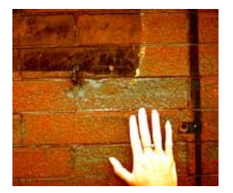
Undamaged historic brick (above). Sandblasted brick (below).

"Chemical or physical treatments, such as sandblasting, that cause damage to historic materials shall not be used. The surface cleaning of structures, if appropriate, shall be undertaken using the gentlest means possible." —The Secretary of the Interior's Standards for Rehabilitation.