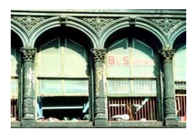
Cast iron may be abrasively cleaned, but must be painted immediately to prevent rust.

remove layers of paint, rust and corrosion. Sandblasting was, in fact, developed originally as an efficient maintenance procedure for engineering and industrial structures and heavy machinery--iron and steel bridges, machine tool frames, engine frames, and railroad rolling stock--in order to clean and prepare them for repainting. Because iron is hard, its surface, which is naturally somewhat uneven, will not be noticeably damaged by controlled abrasion. Such treatment will, however, result in a small amount of pitting. But this slight abrasion creates a good surface for paint, since the iron must he repainted immediately to prevent corrosion. Any abrasive cleaning of metal building components will also remove the caulking from joints and around other openings. Such areas must be recaulked quickly to prevent moisture from entering and rusting the metal, or causing deterioration of other building fabric inside the structure.