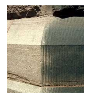
On the left, grit blasting has obliterated the vertical tooling marks from granite, a very dense stone.

In addition to causing physical and aesthetic harm to the historic fabric, there are several adverse environmental effects of dry abrasive cleaning methods. Because of the friction caused by the abrasive medium hitting the building fabric, these techniques usually create