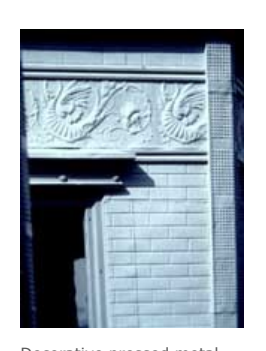
Decorative pressed metal interior or exterior features should not be cleaned abrasively.

Metals: Like stone, metals are another group of building materials which vary considerably in hardness and durability. Softer metals which are used architecturally, such as tin, zinc, lead, copper or aluminum, generally should not be cleaned abrasively as the process deforms and destroys the original surface texture and appearance, as well as the acquired patina.